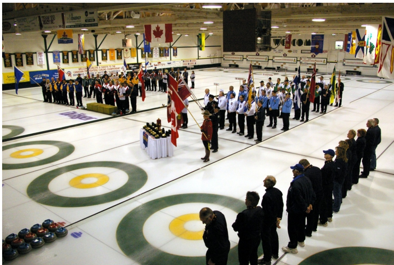
Closing Ceremonies at the Canadian Fire Fighters Curling Championship