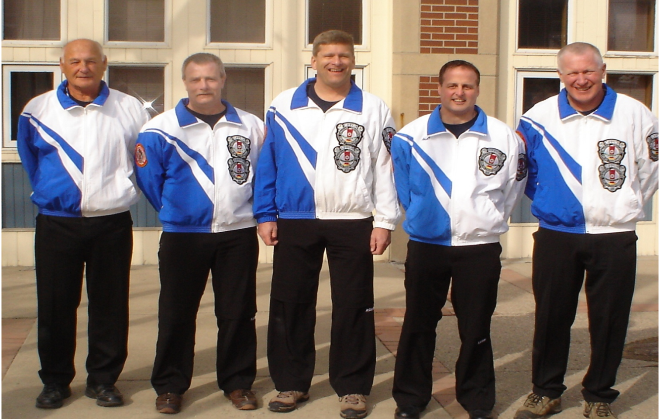
Team BC in Regina 2010

The British Columbia Fire Fighters Curling Association (BCFFCA) is celebrating its 61 th anniversary this season!! The BCFFCA was created in 1959 as a part of the Canadian Fire Fighters Curling Association (CFFCA) bringing fire fighters from across the province and country together in a unique atmosphere of fellowship and competition.